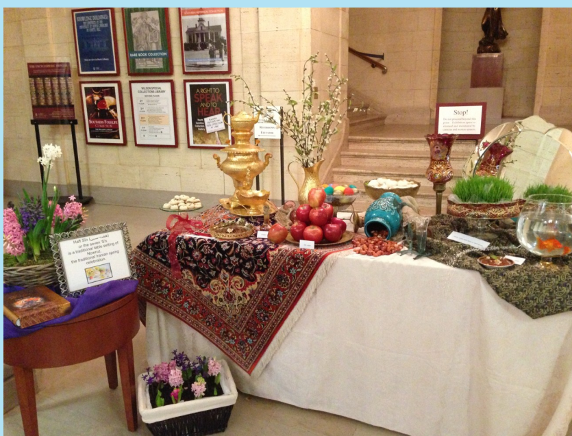
A display for Nowruz, the traditional Iranian spring celebration.