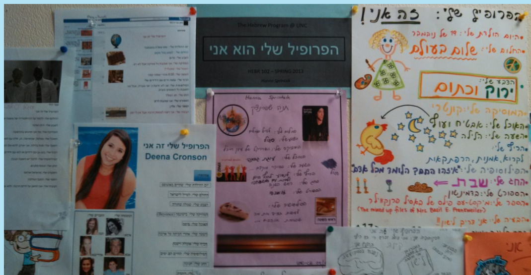
Student work from Hebrew classes throughout the semester, proudly displayed on the main bulletin board here in New West.