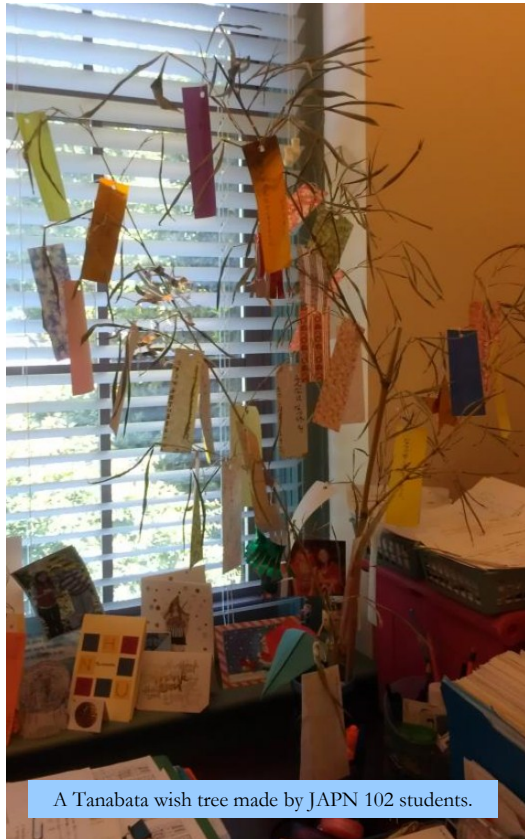
A Tanabata wish tree made by JAPN 102 students.